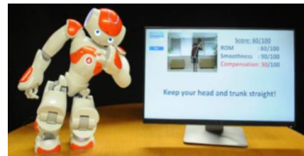
Figure 2: An interactive robot coach monitors a patient's exercise and provides personalized feedback

My research also explores how an interactive robotic coach can collaborate with post-stroke patients to improve their engagement in physical rehabilitation therapy [2]. This system also applies our hybrid intelligence approach to automatically monitor and guide rehabilitation exercises of patients through social interactions (e.g. verbal, visual, and gesture-based feedback in Figure 2). In contrast to prior work that utilizes pre-defined, generic feedback, this system tunes with a new patient's motions and generates transparent, personalized corrective feedback.